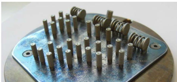
Fig. 1: NiTi samples produced by SLM.

INTRODUCTION: FDA-approved NiTi 1 belongs to the shape memory alloys (SMA) which exhibit superelasticity and the shape memory effect. The reason behind is a reversible phase transition from the low-temperature martensite to the high-temperature austenite. As the shape memory effects and therefore the physiological reactions are intrinsically linked to the crystal structure, we have used x-ray diffraction (XRD) to characterise the specimens. In this study, we used the additive manufacturing technique of selective laser melting (SLM) to fabricate free-form NiTi parts (Fig. 1) with shape memory properties and different phase transition temperatures. 2